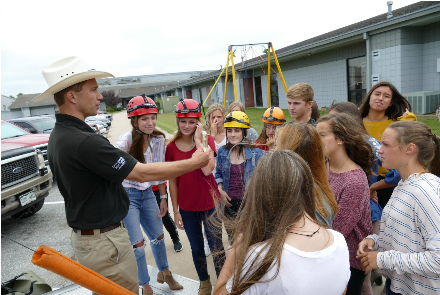
High school students learn bat biology (and skeletal morphology) during a 2018 2-day program