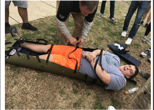
Austin High School student and football player gets ready to ride (successfully!) in the Skedco stretcher.

§116.53. Adventure/Outdoor Education. c) 2) A) use internal and external information to modify movement during performance.