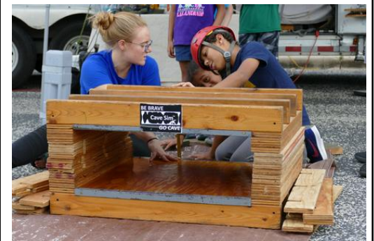
Students at a 2018 Austin PARD program use a tape measure to quantify their squeezebox skills.

§130.43. Principles of Construction. c) 5) A) use a standard ruler, a metric ruler, a measuring tape, and an architectural/engineering scale to measure. §116.53. Adventure/Outdoor Education. b) 2) Students enrolled in adventure outdoor education are expected to develop competency in outdoor education activities that provide opportunities for enjoyment and challenge. Emphasis is placed upon student selection of activities that also promote a respect for the environment and that can be enjoyed for a lifetime.