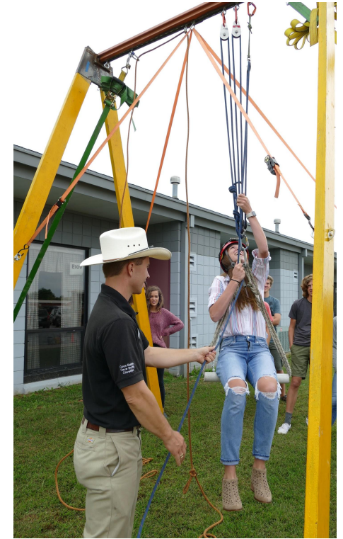
Above, a student uses mechanical advantage to lift herself up the A-frame. Below, students and CaveSim staff destroy a rope in 20 seconds using another rope.

§112.39. Physics. b) 1) Students study ...: laws of motion; ... conservation of energy and momentum; forces; thermodynamics.... Students... practice experimental design and interpretation, work collaboratively with colleagues, and develop critical-thinking skills. c) 1) A) demonstrate safe practices during laboratory and field investigations c) 3) D) research and describe the connections between physics and future careers c) 4) D) calculate the effect of forces on objects, including the law of inertia, the relationship between force and acceleration, and the nature of force pairs between objects using methods, including free-body force diagrams. c) 6) A) investigate and calculate quantities using the work-energy theorem in various situations