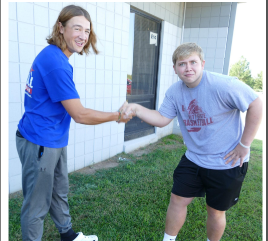
HS students in Oklahoma roleplay bats spreading WNS fungus.

(D) apply conditional probability in contextual problems