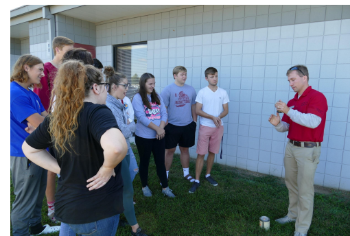
Above, carbide lamp demonstration by CaveSim staff at a high school program in Oklahoma. Below, a stock photo of the lamps we use.