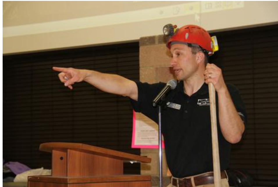
Keynote presentation in Lake George, CO.