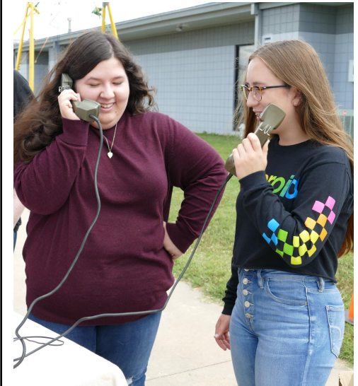
High school students in Oklahoma enjoy using the cave rescue phones.

c) 7) B) investigate and analyze characteristics of waves, including velocity, frequency, amplitude, and wavelength, and calculate using the relationship between wavespeed, frequency, and wavelength;