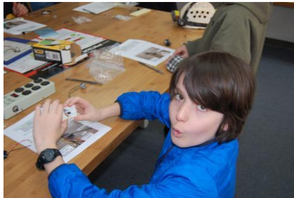
Students from The Colorado Springs School work on Engineering Lab (left) and Advanced Light Lab (right)

Advanced Light Lab: Same as Light Lab, but students also include programmable computer chips in their project. The students learn about duty cycle and Pulse Width Modulation, which can be used to control LED brightness.