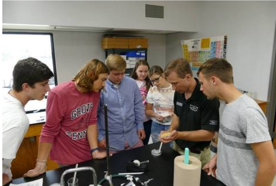
Students at a two-day high school program in Oklahoma get ready to inoculate their Petri dishes.

Biota Lab: Students culture cave biota in Petri dishes, and learn that single-celled organisms can demonstrate intelligence. Students choose from multiple experiments, and discuss the factors that impact the outcome of their experiments.